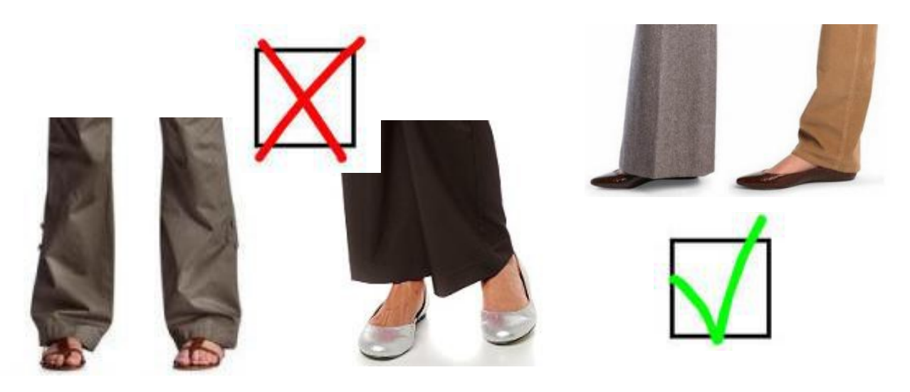
Shoes Shoes must be appropriate for the uniform:

According to image guru Haydee Antezana, your hem should sit where the heel of your shoe meets the sole.