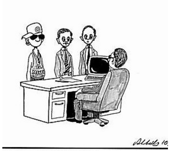
"WITHOUT MENTIONING ANY NAMES, CERTAIN QUESTIONABLE LIBERTIES HAVE BEEN TAKEN WITH OUR CORPORATE DRESS CODE."

As a pilot you are a leader. Even if you are a junior pilot, passengers and cabin crew still see you as a leader. Your image affects the way you are perceived and so contributes to your leadership effectiveness.